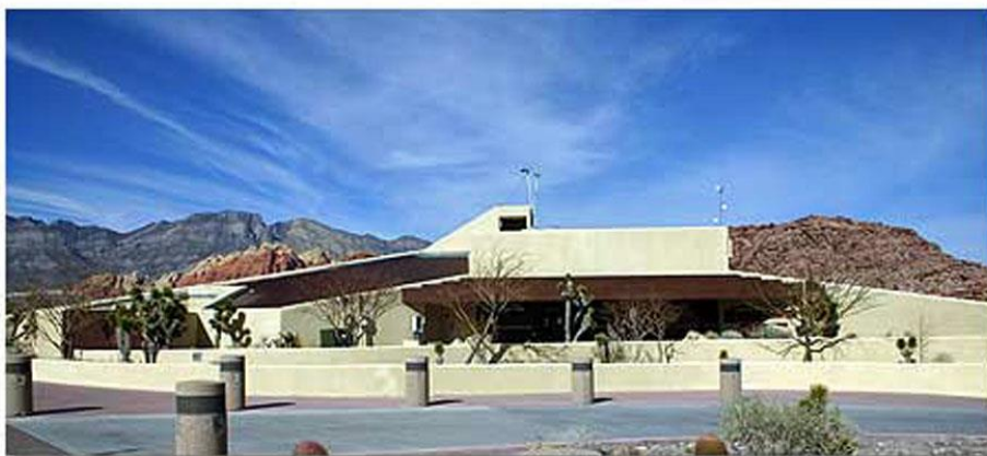
Red Rock Canyon's visitor center.